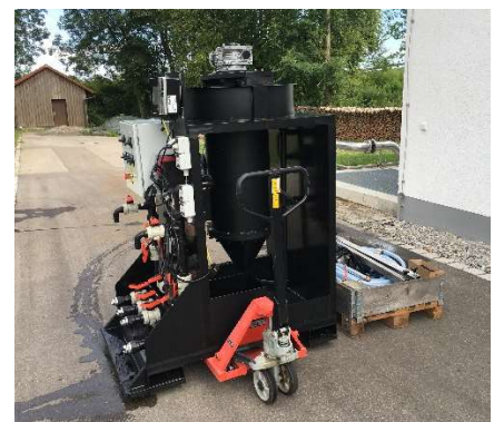
Transport with hand pallet truck

Space requirement for the setup of the tests are approx. 2x3 m as well as the respective access for the extraction of wastewater with a submersible pump at: