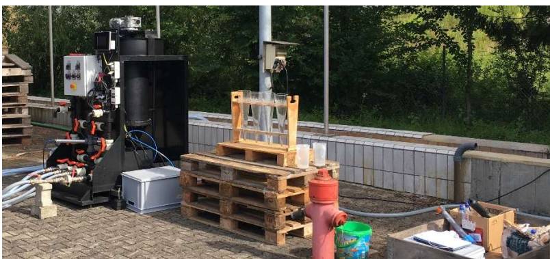
Test setup at the sand trap